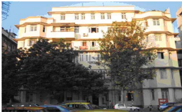
Fig 2. Purandare Griha

Two very important researches in the field of Obstetrics to his credit are :