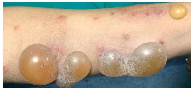
Fig. 2 Tense clear fluid-filled bullae on flexor aspect of forearm