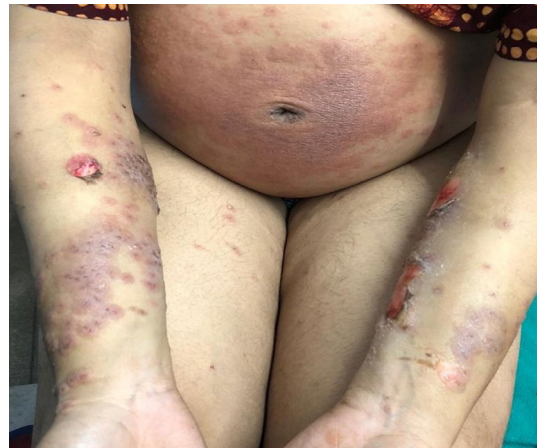
Fig. 1 Erythematous, urticarial plaques with vesicles and erosions involving periumbilical area and both forearms

a full-term normal delivery. She delivered a healthy boy and did not experience flare of disease in the postpartum period also.