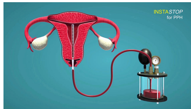
Uterus contracted well, and bleeding stopped completely.