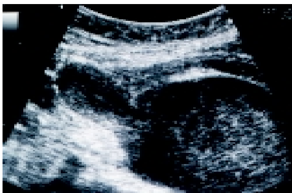
Figure 3. Ultrasonography showing hematometrocolpos

Paper received on 03/12/2003 ; accepted on 14/05/2004