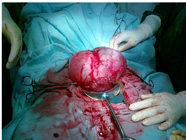
Fig. 1 Uterus with hydatid cyst and scar after cesarean