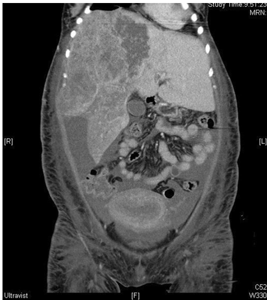
Fig. 1 CT Scan C: large heterogeneous hypovascular mass with irregular edges that presents a peripheral enhancement