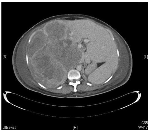
Fig. 2 CT Scan Axial C reveals a large liver mass occupying the entire right hepatic lobe extending medially to segment IV

lateral to the falciform ligament and is subdivided into IVa (superior) and IVb (inferior), measuring 197 \times 156 \times 202 mm, with necrotic parenchyma; the mass amputated the right hepatic vein, the middle and right suprahepatic arteries and compressed the left.