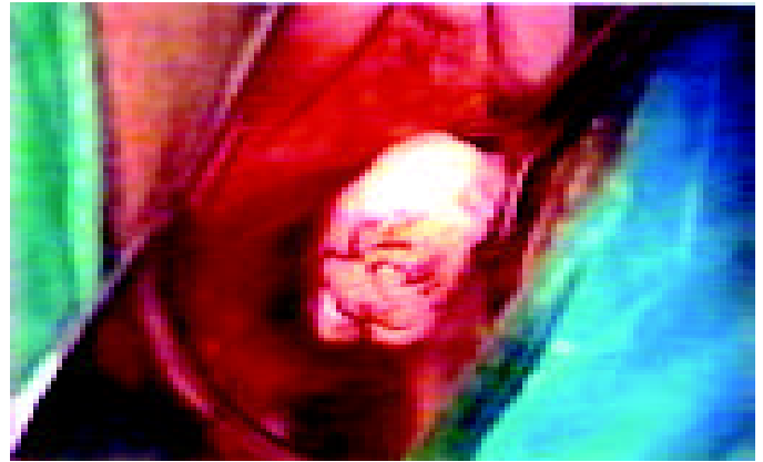
Figure 1. Ovary accessed through the pouch of Douglas.

The pouch of Douglas and vaginal mucosa were sutured. But in patients with an enterocele, the peritoneum was closed as high as possible. Postoperative recovery was smooth and uneventful. The patient could sit up and walk on the day of the operation. Cephalosporin 1g was given intravenously as prophylactic antibiotic in the operation theater and repeated at 12 hour intervals for a total of three doses, and thereafter 500 mg was given orally twice a day for 5 days. Spotting stopped in 2 to