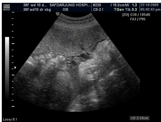
Fig. 1 Placental thickness in a pregnant woman at 32 weeks. The placental thickness is 31.8 mm which correlated with gestational age and biometric parameters

Thick placenta: placental thickness more than 95th percentile.