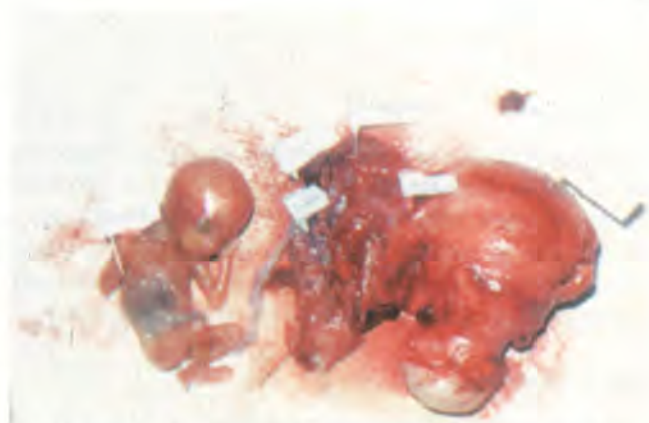
Photograph 1. Specimen taken out after laparotomy: uterus, both tubes, leftsided ovary and on the right side a 16 weeks well formed fetus.

7-B, Shahmina Road, King George's Medical College Campus, Lucknow.